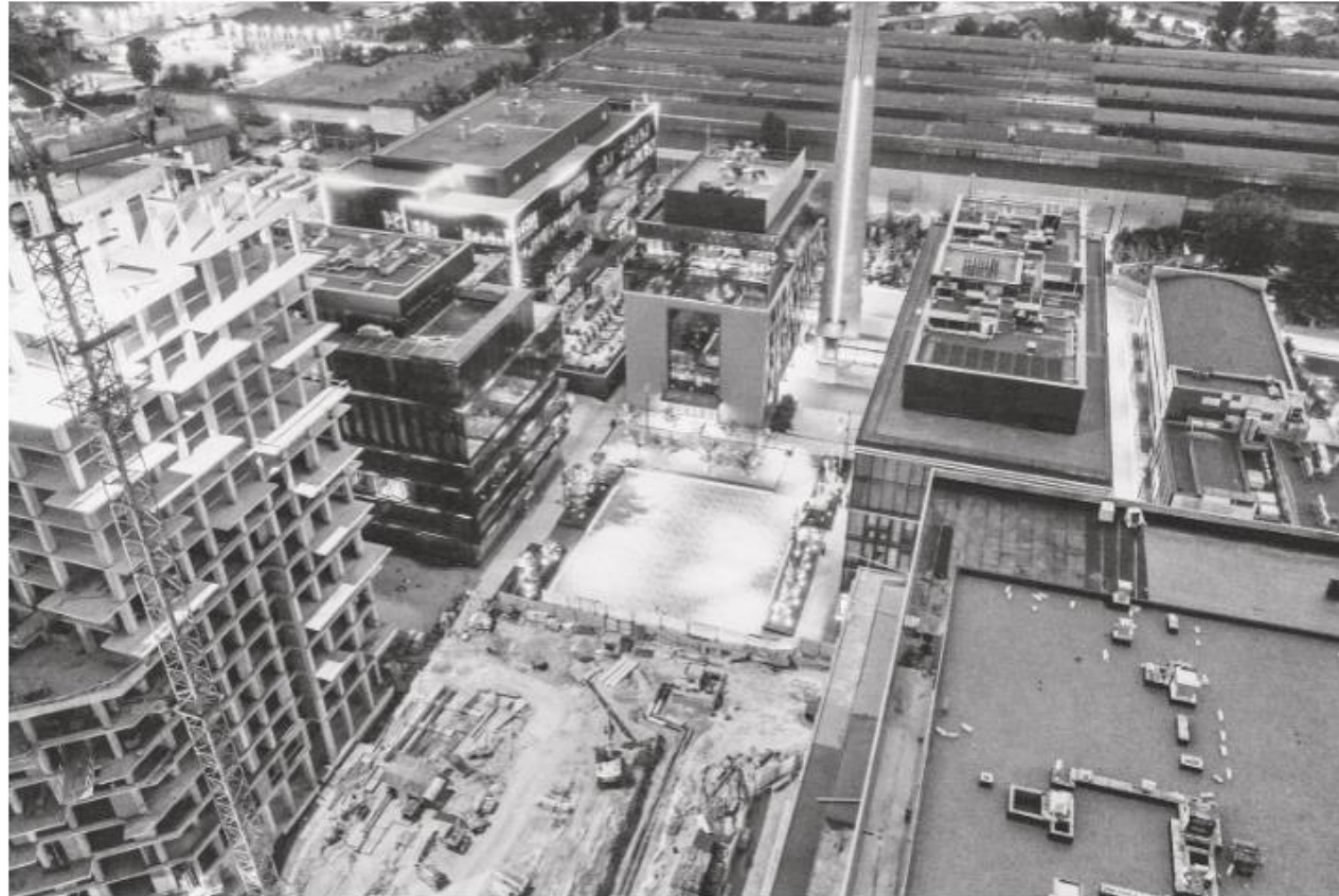
The UNIT.City innovation park in Kyiv, which offers space for startups and large businesses.